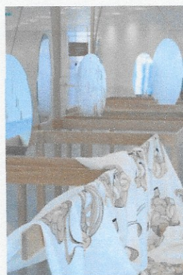
Claire Barclay 'Fault on the Right Side', 2007 Oak, glass with mirroring paint, brass and screen-printed fabric 275 x 696 x 152cm Installation view

Posted in Ceramics, Contemporary Art, Photography, Sculpture, Textiles, Visual Arts Tagged contemporary art, European Art, Fine art, Sculpture, textiles, Visual Arts