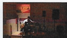
Modern Art Oxford | KALEIDOSCOPE Live - Open Music Archive, Premonition 2037: Lutto Lento 19 May 2016