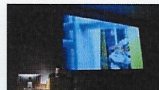
Whitstable Biennale | Silke Panse and Connal Parsley | Ethics, Art and Moving Images 3 June 2016