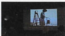
Modern Art Oxford | KALEIDOSCOPE Live | 1998 / Mona Hatoum 2 June 2016