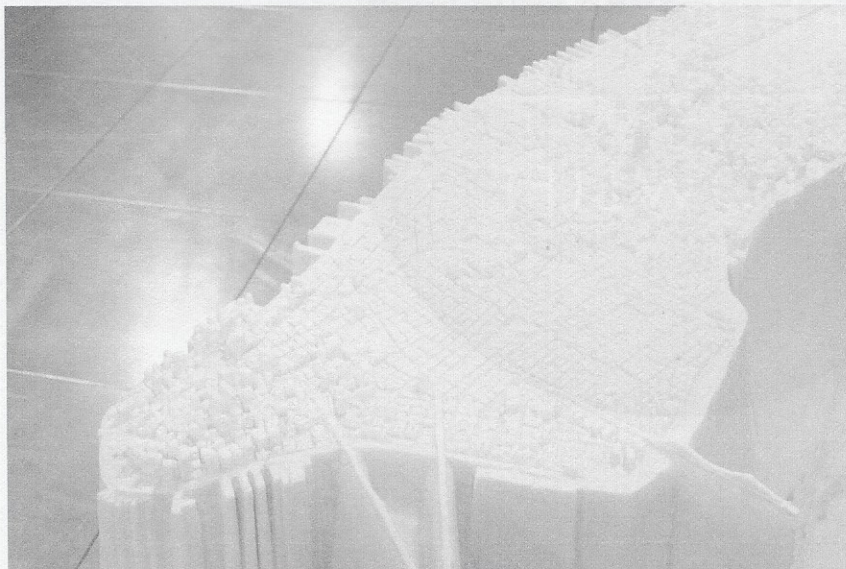
Little Manhattan , 2007–2009 by Yutaka Sone - marble, 55.2 x 265.1 x 85.1 cm

Paradigm Store continues through to 5th November 2014 at 5 Howick Place SW1 1BH – viewing appointments may be arranged with Allison Thorpe at Sutton PR – allison@suttonpr.com