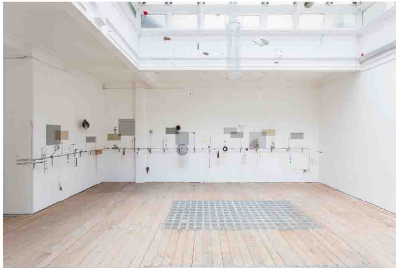
Rodrigo Matheus || Border , 2015 || mixed media || dimensions variable || Copyright 2015 © the artists, the photographers, Ibid || Funded by Arts Council England

Opening hours: Tuesday – Saturday 12 – 6pm or by appointment