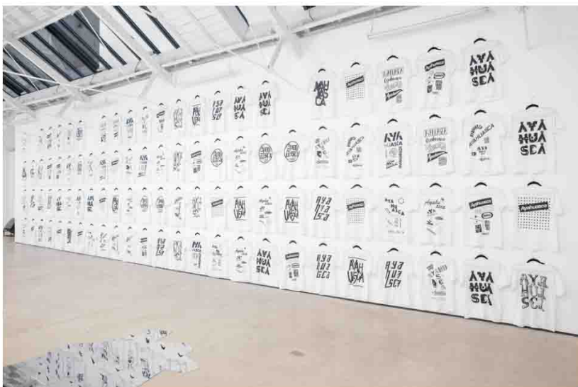
Adriano Costa || Novos Contemporâneos / New Contemporaries-tee time 2015 || Site specific installation print on fabric || Dimensions variable || Ed. of 2 + 1 AP || Photographer: Max Slaven || Copyright the artist courtesy of the artist and Mendes Wood DM, São Paulo || Funded by Arts Council England